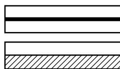
LEAD LINED PARTITIONS